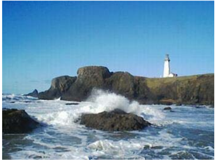
Newport's Yaquina Head and Lighthouse