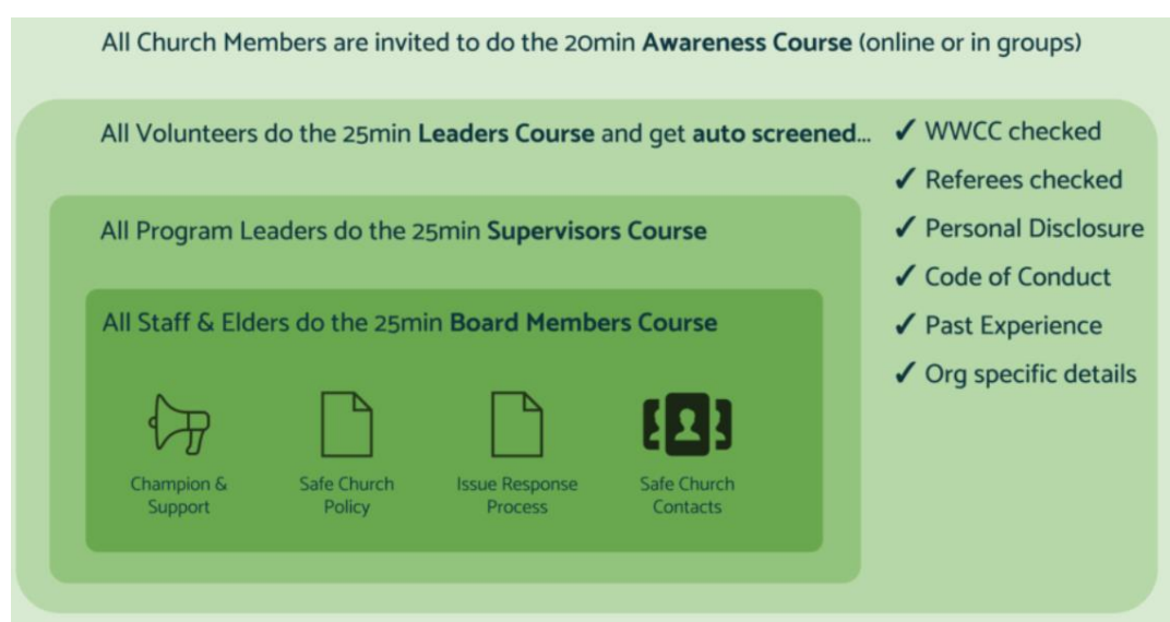
Diagram 1 – Visual explanation of safe ministry training modules www.safeministrycheck.com.au